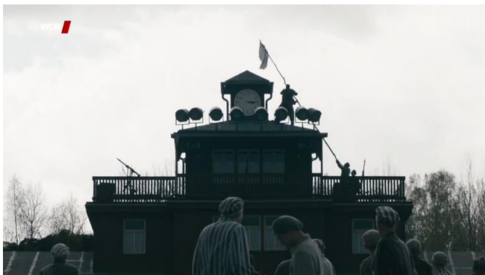
Figure 20. Still from NAKED AMONG WOLVES , Philipp Kadelbach, DE 2015