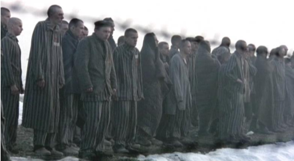
Figure 18. Still from THE TRUCE , Francesco Rosi, IT 1997

Since the beginning of the scene, the only sounds have been the horses' hooves and the inmates' wooden clogs on the hard snow and horses breathing heavily. Next comes a series of shot-reverseshots between, on the one side, Levi, his comrade, and other inmates who are slowly approaching the fence and, on the other side, and through their binoculars, the Soviet soldiers. The horses are filmed from a low camera angle so that they do look enormous, as Levi describes them in his memoir. Contrary to the memoir, however, the soldiers, who have now reached the gate, are expressionless; they show no sign of shock or shame even though they must realize that they have come across an immense crime. Rather, they seem coarse, impassive, at best focused on the task before them. Thus, THE TRUCE neither grants the Soviet soldiers the reactions of "the just man" witnessing someone else's crime, which Levi saw in them, nor does it stage the inmates awaiting their liberators as impressively as Red Army cameramen did at Auschwitz. THE TRUCE does seem to quote historical Soviet footage; however, its shots of prisoners lining up along the barbed wire resemble the blurry Majdanek shots much more than the famous ones at Auschwitz.