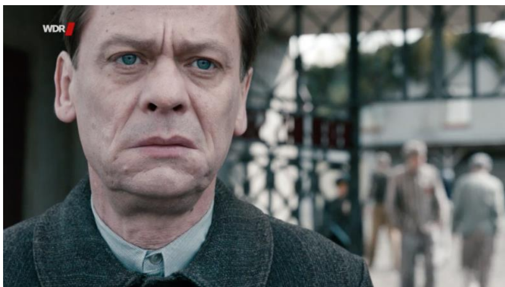
Figure 21. Still from NAKED AMONG WOLVES , Philipp Kadelbach, DE 2015