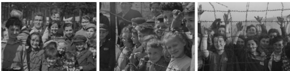
Figure 7. Stills from GERMAN CONCENTRATION CAMP FACTUAL SURVEY , UK 1945/2014

Some of these sequences look as if the initiative to stage them could have come from the survivors themselves, who wanted to symbolize victory, international solidarity, or express respect for the dead by collectively waving into the camera, giving the victory sign, or taking off their caps. This is definitely true of the liberation ceremonies and May Day celebrations that international committees