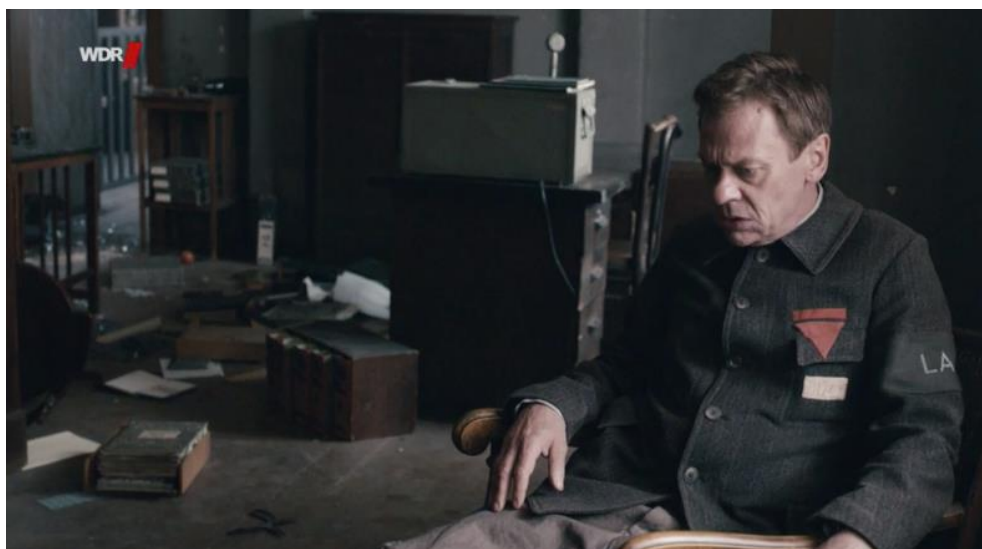
Figure 19. Still from NAKED AMONG WOLVES , Philipp Kadelbach, DE 2015