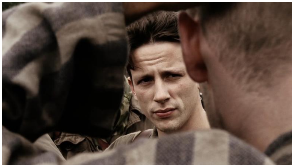
Figure 13. Still from BAND OF BROTHERS , Episode 9: WHY WE FIGHT , David Frankel, US 2001