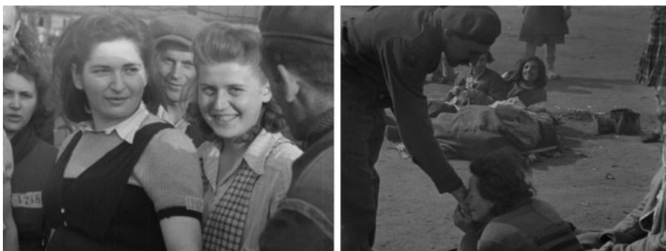
Figure 10. Stills from GERMAN CONCENTRATION CAMP FACTUAL SURVEY , UK 1945/2014

All of the Allied documentaries portray this help more or less explicitly, yet it is surprisingly seldom that we see survivors and liberators genuinely interacting, e.g., in conversation or through bodily contact, of which there must have been more than we are shown. 14