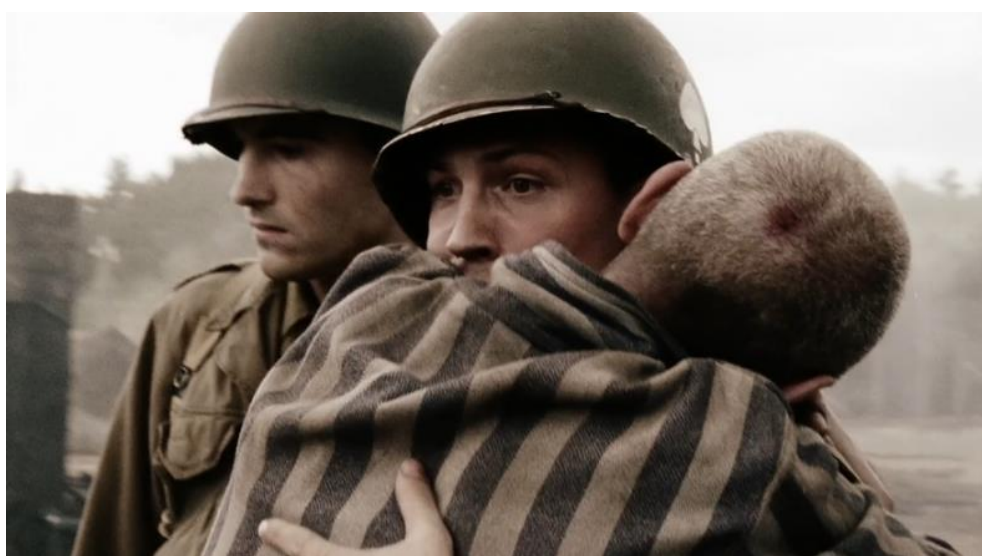
Figure 14. Still from BAND OF BROTHERS , Episode 9: WHY WE FIGHT , David Frankel, US 2001