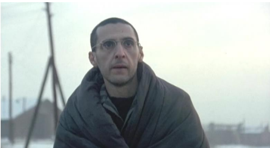
Figure 16. Still from THE TRUCE , Francesco Rosi, IT 1997

Except for this line, which the film almost quotes, the liberation scene in THE TRUCE bears little resemblance to Levi’s description. Rather, it presents its own filmic narrative of an ambivalent moment. After a short, chaotic, and noisy introductory scene in which SS men set fire to huts, shoot some prisoners, order others to burn documents, and blow up a crematorium, the next scene starts very quietly, calmly, and slowly. On the horizon, which is barely visible between “the grey of the snow and the grey of the sky,” four horsemen appear; they come closer and stop. We see in close-up the fur cap of one with a small gold hammer and sickle in a Soviet red star. It is too foggy to read the look in his eyes. One of the four takes out binoculars and inspects what lies in front of them. Cut. From inside the camp, we now see two inmates carrying a dead man in a blanket—others in the background are doing the same—and with a last of their strength roll the corpse into a ditch filled with other corpses and collapse. It is when one of the two stands up, catches his breath, looks around, and sees the four horsemen in the distance that we understand that he is the protagonist, Primo Levi.