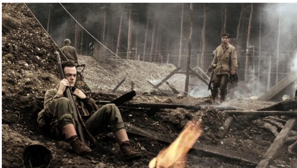
Figure 15. Still from BAND OF BROTHERS , Episode 9: WHY WE FIGHT , David Frankel, US 2001