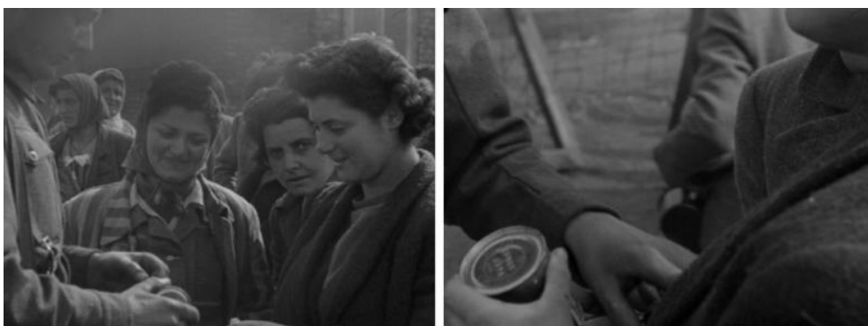
Figure 11. Stills from GERMAN CONCENTRATION CAMP FACTUAL SURVEY , UK 1945/2014

There might be more of this in unedited footage, but it is equally possible that cameramen did not think it important to cover such human interactions. What Allied cameramen apparently did not even try to cover was liberators' own bewilderment, which they regularly expressed in memoirs and interviews. In order to see images of this, we have to turn to feature films, which I will now do. In addition to feature films' ability to turn the camera back on the liberators who in 1944–45 turned their cameras on the liberated camps, they can also tell stories of liberation from the perspective of survivors.