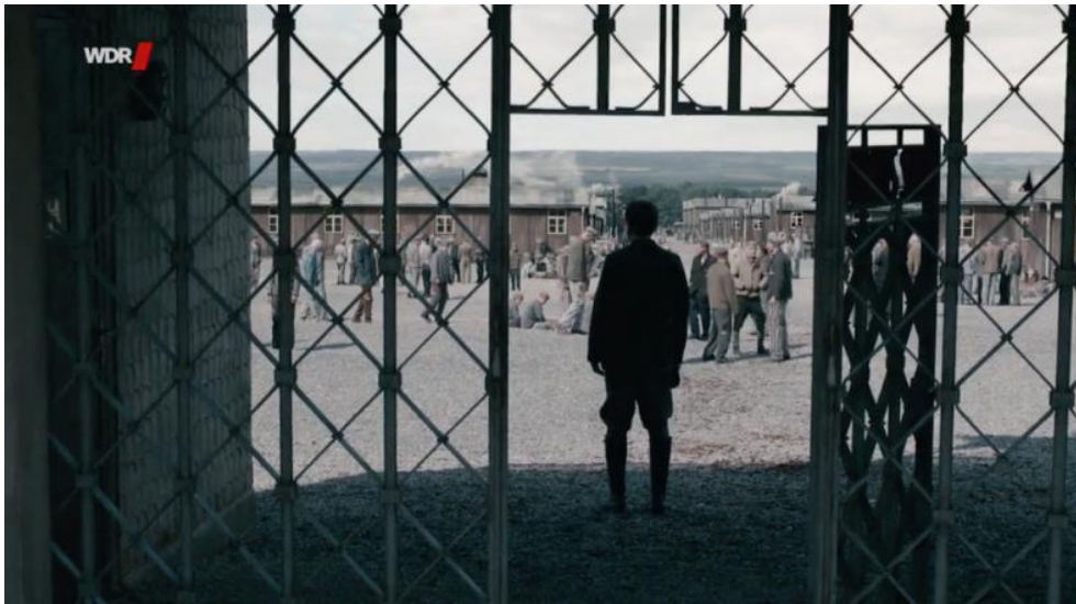
Figure 22. Still from NAKED AMONG WOLVES , Philipp Kadelbach, DE 2015